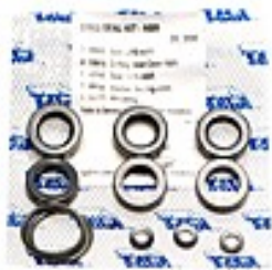
25301 OIL SEAL ( 3 required)